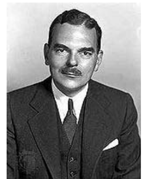
Thomas E. Dewey