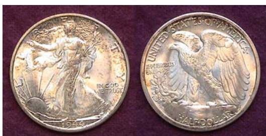
A 1944-S Walking Liberty Half dollar grading MS-64 Noticed the weaker strike across the central portions of the coin. [Magnify to 200% to see details.]

The 1944-D half dollar had a mintage of only 9,769,000 compared with 28,206,000 for the 1944-P while the 1949-S shown below had slightly less at 8,904,000. Despite these lower figures neither coin is scarce because far too many were saved by the roll in “new” condition. The 2010 Red Book does not list an MS-65 grade but in MS-63 the 1944-P is shown at $45 with the 1944-D & S at $55.00 and $65 respectively.