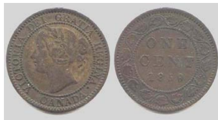
A Canadian 1859 Large cent [Magnify to 200%]

I am sure all of us say “yes” when ask if we are coin collectors. But I think many of us are coin accumulators. I am guilty of the latter. I have coins stuffed into boxes that “I will get to in the future”. The current economic crunch has affected a lot of us. We do not have as much money to spend on coins at shows and shops as we used to, and may forgo traveling to some coin shows because of the cost. That does not mean you also have to cut back on numismatics. Turn you attention to your own accumulations. I have begun to do that and have already made an interesting discovery. I have a handful of Canadian large cents that have been stored in a plastic bag for years. One of these cents is dated 1859. I turned to the Standard Catalog of World Coins - 19 th century . The coin is listed as KM# 1. It also lists four varieties: 9/8 wide 9, narrow 9 and double-punched narrow 9 types I & II. In VG 8 the values range anywhere from $2.25 to 175.00 (in the 4 th edition). With such a big spread in the values, identifying which type you have becomes more important, but in SCWC there are only vague descriptions. This is another reason to have a good numismatic library. I turned to Charlton Standard Catalogue Canadian Coins and they have clear pictures of each type. The coin I have is the double-punched narrow 9 type I. I grade my coin Fine to Very Fine and find out it is valued at $250-350.