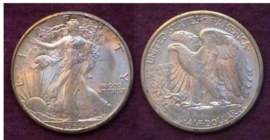
A nicely toned 1944-D Walking Liberty Half dollar grading MS-64 [Magnify to 200% to see details.]

The 1944-D half dollar had a mintage of only 9,769,000 compared with 28,206,000 for the 1944-P while the 1949-S shown below had slightly less at 8,904,000. Despite these lower figures neither coin is scarce because far too many were saved by the roll in “new” condition. The 2010 Red Book does not list an MS-65 grade but in MS-63 the 1944-P is shown at $45 with the 1944-D & S at $55.00 and $65 respectively.