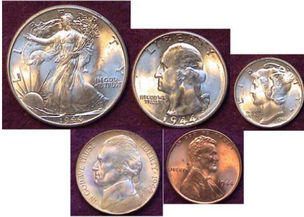
The obverses of an uncirculated 1944-P Year Set [Magnify to 200% to see details.]

The United States had been on a war footing since the Japanese attack at Pearl Harbor on December 7, 1941. By 1944 the Great Depression was ostensibly over as factories were fully employed, many building ships and turning out weaponry for our soldiers fighting on two fronts overseas.