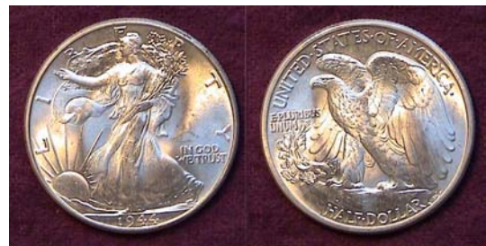
A mint state-65 1944 Walking Liberty Half dollar [Magnify to 200% to see details.]

One of our club members and past President Bennie Bolgla was among the crack troops that landed on Omaha Beach along the Normandy coast in the early dawn hours as part of the Allied invasion force on June, 6, 1944. That was 65 years ago. The area comprised a fifty mile stretch between the Contentin Peninsula and Orne River. Despite the heavy air and battleship bombardment of Nazi positions along the shoreline, the first wave of soldiers to reach the French coast at Omaha beach were met by stiff resistance from the German fortresses perched some 170 feet along the bluffs beyond the landing area. When Bennie told me he was one of the many men who landed there on that historic day, I mentioned that my wife and I had recently seen the then movie, "Saving Private Ryan" starring Tom Hanks and asked him whether the situation he and his fellow soldiers encountered was really that bad? He replied, "It was a heck of a lot worse" or words to that effect. As children and grandchildren of that generation we owe much to members like Bennie and the other brave GI's and their commanders who remained steadfast during the day long battles finally securing the beachhead that was to eventually alter the course of World War II.