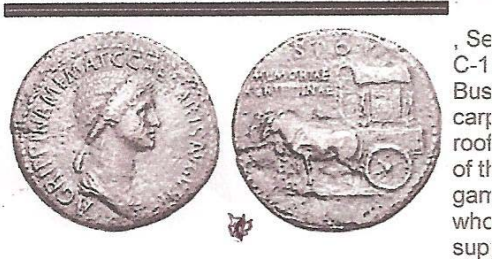
Sestertius, Rome, Under Caligula (37-41 AD)