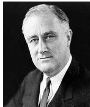
Franklin Delano Roosevelt

As for most years, coin production from the branch mints--Denver and San Francisco--were substantially smaller than that of Philadelphia. This is reflected somewhat in the General Election results of 1944 in which Franklin D. Roosevelt won an unprecedented 4 th term as President narrowly defeating Thomas E. Dewey by 3 million in the popular vote but sweeping his opponent 432 to 99 in the number of electoral votes by state. The number of votes apportioned in the Electoral College is based on the population of each state and the Mints reflected this in their annual output.