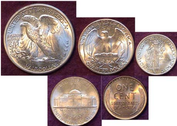
The reverses of an uncirculated 1944-P Year Set [Magnify from 200% to 500% to view details.]

With nickel needed for the war effort, starting in October of 1942, the Jefferson 5¢ alloy was changed from 75% copper and 25% nickel to 56% silver, 35% manganese and 9% copper. A large Mintmark was placed over the dome of Monticello on the reverse and that included the P for Philadelphia. In 1943, the cent's alloy was completely changed to steel coated with zinc. People started confusing it with the dime, so in 1944, the Mint began using salvaged cartridge cases made of bronze that had an alloy of 95% copper and 5% zinc. These were struck through the 1946 cent coinage.