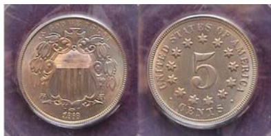
An iridescent toned 1868 Shield nickel graded MS-63 by PCGS

The coin shown above was acquired at our May coin show. The Shield nickel (1866-1883) was the first of our 5¢ nickel types and was struck to ease the coin shortage brought about during the War