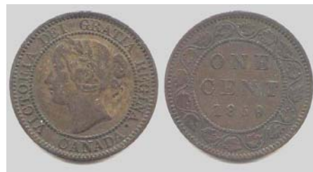
A Canadian 1859 Large cent [Magnify to 200%]

I am sure all of us say “yes” when ask if we are coin collectors. But I think many of us are coin accumulators. I am guilty of the latter. I have coins stuffed into boxes that “I will get to in the future”. The current economic crunch has affected a lot of us. We do not have as much money to spend on coins at shows and shops as we used to, and may forgo traveling to some coin shows because of the cost. That does not mean you also have to cut back on numismatics. Turn you attention to your own accumulations. I have begun to do that and have already made an interesting discovery. I have a handful of Canadian large cents that have been stored in a plastic bag for years. One of these cents is dated 1859. I turned to the Standard Catalog of World Coins - 19 th century . The coin is listed as KM# 1. It also lists four varieties: 9/8 wide 9, narrow 9 and double-punched narrow 9 types I & II. In VG 8 the values range anywhere from $2.25 to 175.00 (in the 4 th edition). With such a big spread in the values, identifying which type you have becomes more important, but in SCWC there are only vague descriptions. This is another reason to have a good numismatic library. I turned to Charlton Standard Catalogue Canadian Coins and they have clear pictures of each type. The coin I have is the double-punched narrow 9 type I. I grade my coin Fine to Very Fine and find out it is valued at $250-350.