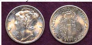
A BU 1944-S Mercury dime showing fully split bands [Magnify to 500% to see details.]

As a rule the coins struck at the San Francisco Mint during this period received weaker strikes than Philadelphia or Denver and the 1944-S Walker shown above is no exception. A well struck 1944-S half that appears comparable to a 1944-P is a scarce coin and could be priced as high as $600 according to the latest Coin World monthly issue of Coin Values .