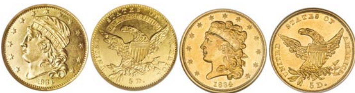
The two types of $5.00 quarter eagles struck in 1834

As recently as 2005 when gold was still around $525 an ounce the Classic Head no motto gold coins with much larger mintages were still moderately priced through AU-50 but now with gold hovering between $900 and $950 they too have become costly and are only on the cusp of affordability.