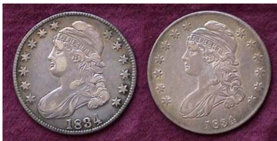
Show at left is the older 50¢ subtype along side the newer one at right. While the two coins look very similar there are subtle differences. Grading each is easier since there is noticeably more wear on the coin at the left.