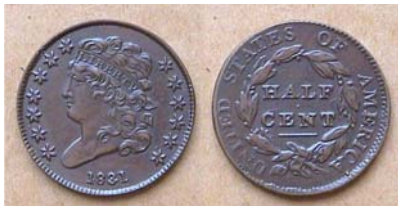
An 1831 Classic Head 1/2¢ ("Electro") [Use 3X glass or magnify page to 200%]