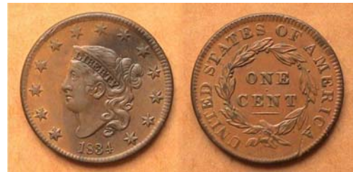
An 1834 Coronet Large Cent The large cent was roughly 28 to 29 mm in diameter. [Use 3x magnifying glass or magnify page to 200%.]

While mint records are spotty for this era, the 2010 Red Book lists a reported mintage of 141,000 for the 1834 half cent. A closer look at the coin pictured above indicates little wear and despite a little discoloring due to toning over the years the specimen appears to be original and well struck. Whether one grades the coin XF-45 or AU-50 it is a nice coin for type.