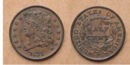
An 1834 Classic Head half Cent The copper denomination was 23.5 mm in diameter [Use 3x magnifying glass or magnify page to 200%.]

For most collectors, the copper and silver coin mintages for 1834 have large enough mintages to be affordable in grades from VG-8 through XF-45.