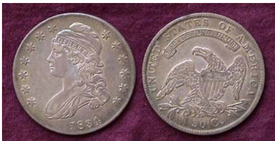
An 1834 Bust half dollar, O-111, obv sub-type III [Use 3x magnifying glass or magnify page to 200%.]

Upon magnification this coin “comes alive”. It may not be certifiable because it might have been cleaned a long time ago; then gradually toned back to a charcoal gray color. It is a strong XF with many details showing. The mintage for the 1834 quarter was 286,000 but it is still considered a common date because there are enough survivors in all collectible grades to meet the demand.