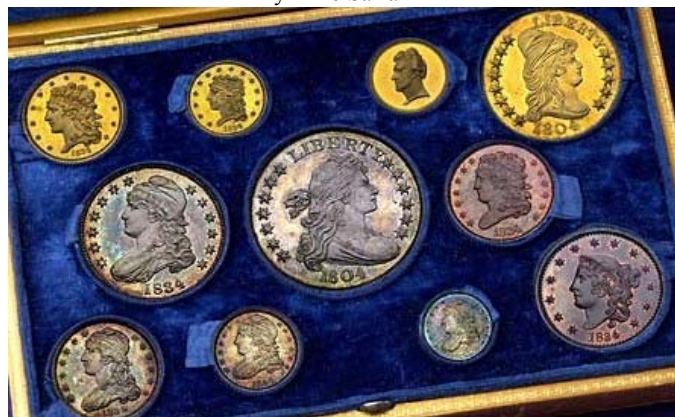
The famed 1834 King of Siam Presentation Proof Set Including small Andrew Jackson medallion [Use a 3X magnifying glass or magnify page to 200% to see details.]

Here's an interesting numismatic trivia question. In 1796 all ten authorized denominations were coined for the first time in the same year. In what year would all our ten denominations intended for circulation be struck again?