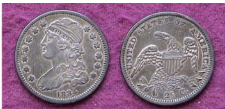
An 1834 reduced size Capped Bust Quarter dollar In 1831, the diameter was reduced from 27 mm to 24.3, the same as today. [Use 3x magnifying glass or magnify page to 200%.]

Upon magnification this coin “comes alive”. It may not be certifiable because it might have been cleaned a long time ago; then gradually toned back to a charcoal gray color. It is a strong XF with many details showing. The mintage for the 1834 quarter was 286,000 but it is still considered a common date because there are enough survivors in all collectible grades to meet the demand.