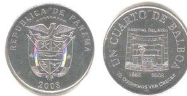
A 2008 UN cuarto de balboa commemorative [Use 3x magnifying glass or magnify page to 200%.]

I spent two weeks in Panama earlier this year on a mission for the Army and discovered that Panama released two different “un cuarto de balboa” coins (equal to a US quarter) in 2008. One has a breast cancer awareness ribbon on it and the other celebrates the 50 th anniversary of the Children’s Hospital. I obtained a few rolls of the coins and while sorting through them I found one of the Children’s Hospital coins had been struck through by a foreign object on the obverse and reverse.