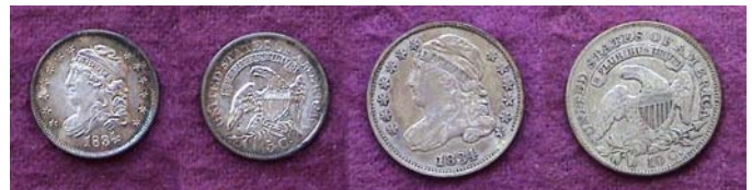
The 1834 Capped Bust half dime, (15.5 mm) and dime, (18.2 mm). [Use 3x magnifying glass or magnify page to 200%.]

According to Mint records, 1,855,100 cents were issued in 1834; around one to one and a half million less than the surrounding years. Still, the date is considered common and many examples grading Fine through AU-50 can be found.