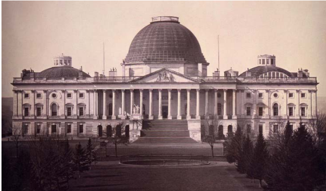
In 1834, the Capitol Building looked a lot different than it does today. This is an actual photograph taken in 1846.