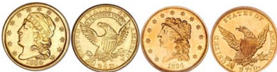
The two types of $2.50 quarter eagles struck in 1834 [Use 3x magnifying glass or magnify page to 200%.]

As for our regular circulating coinage, there were eight denominations produced in 1834. These included two in copper, the Classic Head half cent and Coronet large cent; four in silver, the Capped Bust half dime, dime, quarter and lettered edge Bust half dollar and two in gold; the $2.50 quarter eagle and $5.00 half eagle. Of the gold, two different types were struck in 1834; the outgoing large size Capped Head facing left with motto (for E PLURIBUS UNUM) and the Classic Head no motto styles for the quarter eagle and half eagle. The with motto gold pieces are both quite rare and exorbitantly expensive in all grades.