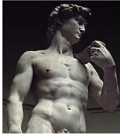
Michelangelo's David, completed in 1504. 17 Feet high, 3 years in the making.

independent city-states. Some Italian city-states became great military powers very early on. Venice and Genoa acquired vast naval empires in the Mediterranean and Black Seas. During the Fourth Crusade (1204), Venice conquered a quarter of the Byzantine Empire.