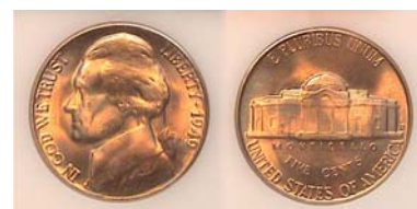
A 1949-D Jefferson nickel grading MS-65 [Magnify to 200% to see details.]

Of the three Mints issuing Roosevelt dimes in 1949, the San Francisco Mint offering represents the closest to a "key" date in the entire silver portion of the series (1946-64). Going back in time the 1978 Red Book lists a 1949-S in Unc at $15.00, with the '49-P priced at $12.00. (There was no distinction between MS-63 and MS-65 back then.) Most of the other dates were listed in Unc from 75¢ to $1.00. The 2012 Red Book lists the 1949-S dime at $42.00 in MS-63 and $55.00 in MS-65 with the 1949-P at $26 and $32 and the 1949-D at $12 and $20 respectively. The myriad of common dates are listed at $2.75 to $3.00 in MS-63 but in MS-65 they jump to $6.00 to $7.00, so one could hardly call the Roosevelt dime series a good investment. Even back in the late 1940's the purchasing power of ten cents had already begun to diminish, so putting away an uncirculated specimen of the low mintage 1949-P or S dime did not create much of a financial burden on the collector. As a result there are simply too many BU 1949 dimes around to warrant an increase above the silver rate which is now higher than Red Book listings.