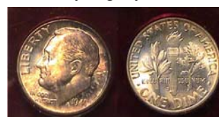
A toned 1949-S Roosevelt dime [Magnify to 200% to see details.]

No quarters were produced at the San Francisco Mint in 1949 and even the Philadelphia and Denver Mints issued smaller numbers than the surrounding years. Some 9.3 million were struck in Philadelphia and slightly over 10 million at the Denver facility. The latest Red Book lists them at $60 and $50 respectively in MS-65, only slightly less in MS-63.