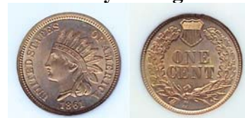
An 1861 Indian Head copper-nickel cent graded MS-64 by NGC [Use 3X glass or magnify page to 200% to view details.]

From 1856 thru 1864 our first small cents were struck in a copper-nickel alloy of .800 copper and .200 nickel. With the exception of the trial issue of 1856, the Flying Eagle coins of 1857 & 58 along with the first six years of the Indian Head obverse design (1859-64) were struck in mintages of over 10 million and are all considered fairly common dates. With a mintage of 10,100,000 however, the 1861 has the lowest number of pieces struck in a single year of the copper-nickel series, save for the rare 1856 issue yet it is still priced close to the prices of the other dates in all grades. This specimen was acquired at the Augusta Coin Club Show on May 7, 2010.