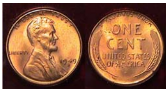
A 1949-S Lincoln cent Full Red MS-65 [Magnify from 200% to 500% to see details.]

In 1949 the production of Lincoln cents at all three mints decreased dramatically with the 1949-S having the lowest mintage, 64,290,000. Compared with over 1 billion from each Mint being delivered today, one would think the '49-S would be scarce but in MS-65, the 2012 Red Book lists it at only $6.00, $5.00 for the 1949-D and $4.00 for the no mintmark 1949-P.