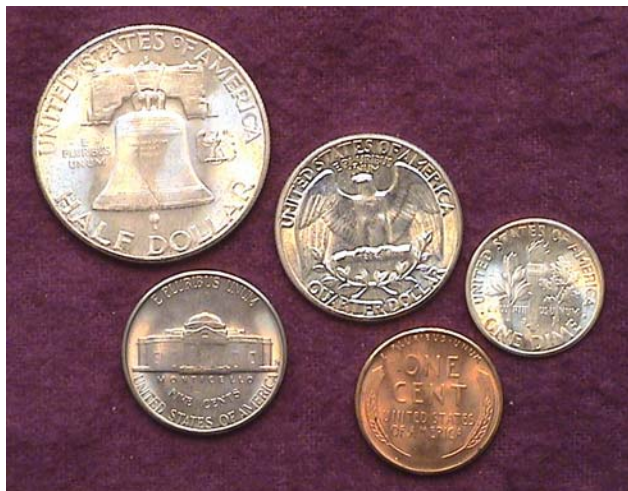
The reverses of the 1949-S Year set except for the 1949-P Quarter

From 1948, the initial year of the Franklin Half dollar through 1964, the first year of the Kennedy 50¢ piece, our dimes, quarters and halves were still struck in .900 fine silver. Unlike the Mercury dime or Walking Liberty half dollar series, there are no major rarities to be found among the yearly coinages during this period other than the 1955 double die cent, also some D over S mint mark issues along with some lower mintage dates grading MS-65 or better. When it comes to 1949, the 1949-D Franklin half dollar in MS-65 is considered quite scarce as it is valued at $600.00 compared with only $70.00 for a MS-63 specimen according to the 2012 Red Book .