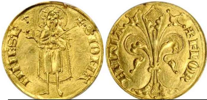
Republic of Florence - Fiorino d'oro Gold Florin No Date; Issued from 1252-1300

Some feudal lords existed with a servile labor force and huge tracts of land, but by the 11th century, many cities, including Venice, Milan, Florence, Lucca, Pisa, Siena, Genoa, Cremona and others, had become large trading metropolises, able to fight for independence from their formal sovereigns, and thus became