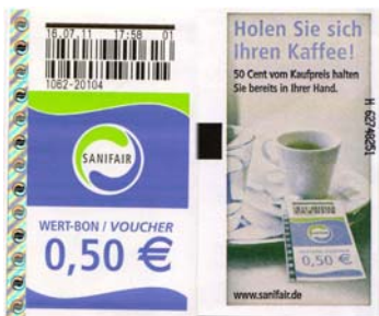
A European Restroom Card valued at 50 euro cents [Use 3X glass or magnify to 200%]

On line research revealed there is a Belgian version that looks the same but has "BTVA" on it instead of LBT.