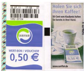
A European Restroom Card valued at 50 euro cents [Use 3X glass or magnify to 200%]

On line research revealed there is a Belgian version that looks the same but has "BTVA" on it instead of LBT.