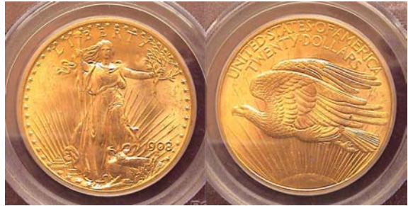
The extremely common 1908 no motto Saint-Gaudens Double Eagle Graded MS-64 by PCGS In 2005 it cost $650.00. Today it is priced at a whopping $2,095.00 [Use 3X glass or magnify page to 200% to view details.]