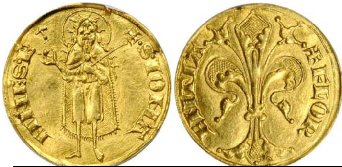
Republic of Florence - Fiorino d'oro Gold Florin No Date; Issued from 1252-1300

Some feudal lords existed with a servile labor force and huge tracts of land, but by the 11th century, many cities, including Venice, Milan, Florence, Lucca, Pisa, Siena, Genoa, Cremona and others, had become large trading metropolises, able to fight for independence from their formal sovereigns, and thus became