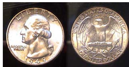
A 1949-P Washington Quarter grading MS-65 [Magnify to 200% to see details.]

The 1949-D Franklin half had a mintage of 4.1 million compared with only 3.7 million for the 1949-S but in MS-65 it is a lot rarer. The coin pictured above has some peripheral toning and upon closer magnification one will observe some light streaking but overall, the fields are clean. The uncertified example above would probably grade MS-64. For those seeking an MS-65 1949-D half dollar the collector is strongly advised to choose a certified MS-65 example from any of the four major certification companies, PCGS, NGC, Anacs and ICG.