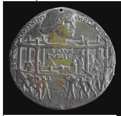
Medal with bust of Lorenzo Di Medici (1449-1492), ruler of Florence.

The Medici family was very prominent in the history of Florence. This