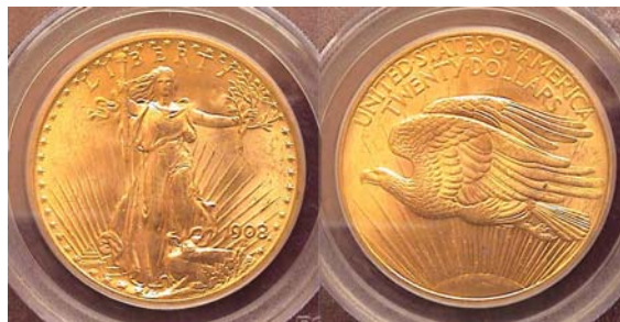
The extremely common 1908 no motto Saint-Gaudens Double Eagle Graded MS-64 by PCGS

In 2005 it cost $650.00. Today it is priced at a whopping $2,095.00 [Use 3X glass or magnify page to 200% to view details.]