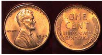
A 1949-S Lincoln cent Full Red MS-65 [Magnify from 200% to 500% to see details.]

In 1949 the production of Lincoln cents at all three mints decreased dramatically with the 1949-S having the lowest mintage, 64,290,000. Compared with over 1 billion from each Mint being delivered today, one would think the '49-S would be scarce but in MS-65, the 2012 Red Book lists it at only $6.00, $5.00 for the 1949-D and $4.00 for the no mintmark 1949-P.