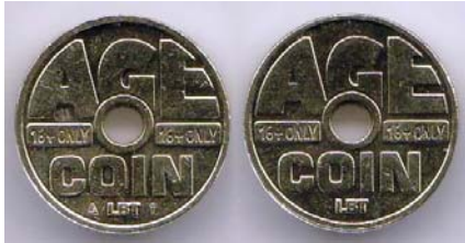
An AGE Token used in the Netherlands for Cigarettes [Use 3X glass or magnify to 200%]

My wife and I recently spent three weeks travelling in Europe visiting World War II sites. We went through 11 countries and had the opportunity to spend, and collect, 5 different currencies. The Euro was used in the majority of the countries. Besides coins, I managed to obtain two numismatic items that I had not anticipated.