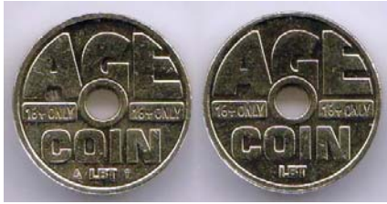
An AGE Token used in the Netherlands for Cigarettes [Use 3X glass or magnify to 200%]

My wife and I recently spent three weeks travelling in Europe visiting World War II sites. We went through 11 countries and had the opportunity to spend, and collect, 5 different currencies. The Euro was used in the majority of the countries. Besides coins, I managed to obtain two numismatic items that I had not anticipated.