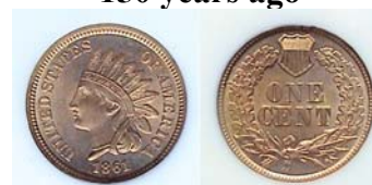
An 1861 Indian Head copper-nickel cent graded MS-64 by NGC [Use 3X glass or magnify page to 200% to view details.]

From 1856 thru 1864 our first small cents were struck in a copper-nickel alloy of .800 copper and .200 nickel. With the exception of the trial issue of 1856, the Flying Eagle coins of 1857 & 58 along with the first six years of the Indian Head obverse design (1859-64) were struck in mintages of over 10 million and are all considered fairly common dates. With a mintage of 10,100,000 however, the 1861 has the lowest number of pieces struck in a single year of the copper-nickel series, save for the rare 1856 issue yet it is still priced close to the prices of the other dates in all grades. This specimen was acquired at the Augusta Coin Club Show on May 7, 2010.