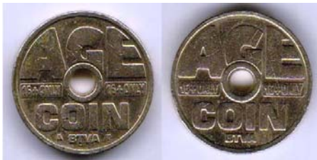
An AGE Token used in Belgium for Cigarettes [Use 3X glass or magnify to 200%]

In the Netherlands you must be 16 years or older to buy cigarettes. The cigarette machine was downstairs at the hotel where I stayed, thus its use cannot be monitored. To buy cigarettes you get a token from the front desk and then have to insert the token and the euros to cover the cost of the cigarettes. The token has no value but is actually an ID check for age. This is the first token I have come across that had that purpose.