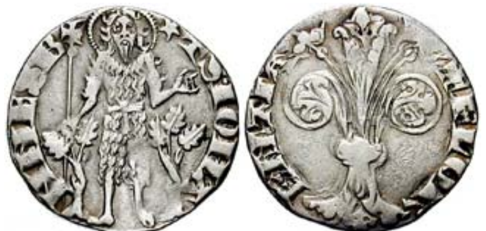
Silver Popolino- Florence, circa 1306. Motifs and inscriptions are the same as the Florin

Both the gold florin and the silver Popolino have the inscription FLORENTIA and the Italian Fleur de lis motif on the obverse, and St John the Baptist, with the inscription S IOHANNES, on the reverse.