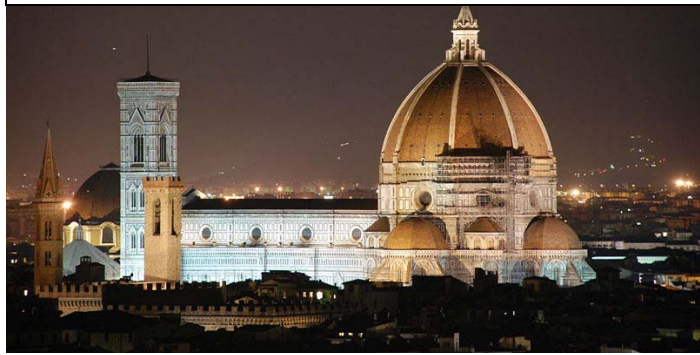
Church of Santa Maria del Fiore (Il Duomo). Started in 1296, The Dome was added by Brunelleschi in 1436

better than the rest of Western Europe. Many of these cities were survivors of earlier Etruscan and Roman towns which had existed within the Roman Empire.