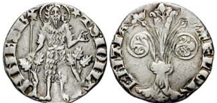
Silver Popolino- Florence, circa 1306. Motifs and inscriptions are the same as the Florin

Both the gold florin and the silver Popolino have the inscription FLORENTIA and the Italian Fleur de lis motif on the obverse, and St John the Baptist, with the inscription S IOHANNES, on the reverse.