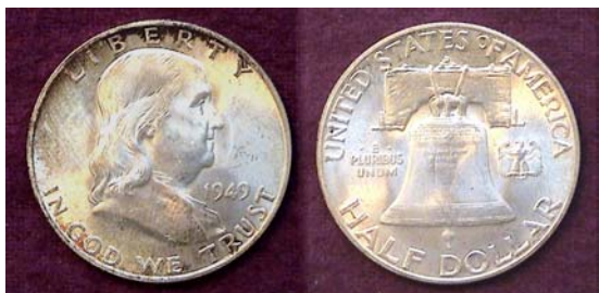
A 1949-D Franklin Half grading MS-64 [Magnify to 200% to see details.]

From 1948, the initial year of the Franklin Half dollar through 1964, the first year of the Kennedy 50¢ piece, our dimes, quarters and halves were still struck in .900 fine silver. Unlike the Mercury dime or Walking Liberty half dollar series, there are no major rarities to be found among the yearly coinages during this period other than the 1955 double die cent, also some D over S mint mark issues along with some lower mintage dates grading MS-65 or better. When it comes to 1949, the 1949-D Franklin half dollar in MS-65 is considered quite scarce as it is valued at $600.00 compared with only $70.00 for a MS-63 specimen according to the 2012 Red Book .