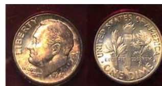
A toned 1949-S Roosevelt dime [Magnify to 200% to see details.]

No quarters were produced at the San Francisco Mint in 1949 and even the Philadelphia and Denver Mints issued smaller numbers than the surrounding years. Some 9.3 million were struck in Philadelphia and slightly over 10 million at the Denver facility. The latest Red Book lists them at $60 and $50 respectively in MS-65, only slightly less in MS-63.